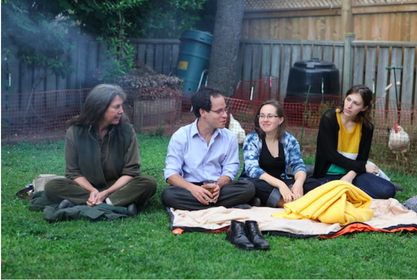
WED JUN 13, 2012